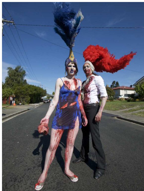
Zombie lesbian showgirls

Rogan Brown Producer, Publicist 106 Nelson Road, Sandy Bay, TAS, Australia 7005 rogan.brown@gmail.com +61 414 870 624 (Cell) +61 3 6225 1393 (Home)